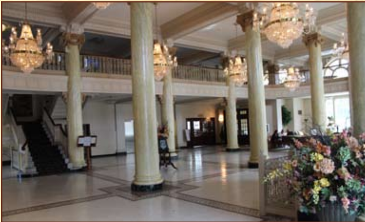
The Main Lobby of Hotel Utica. The Registration table was setup next to the Stairway. There was Hospitality Volunteers serving beverages and snacks upstairs along the Mezzanine floor. Grapevine and AA Literature were also available here.