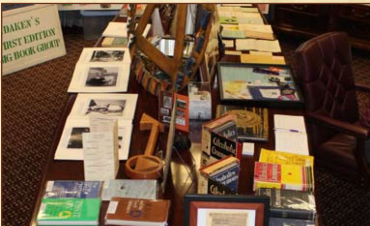
Conference Table used to display early editions of "Alcoholics Anonymous", including First Printing and First Editions.