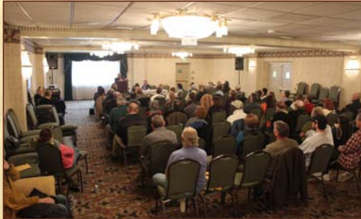
The Saranac Banquet Room.