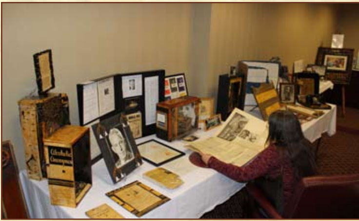
Displays of Dioramas, photographs, news articles and artifacts of Bill W. and Dr. Bob.