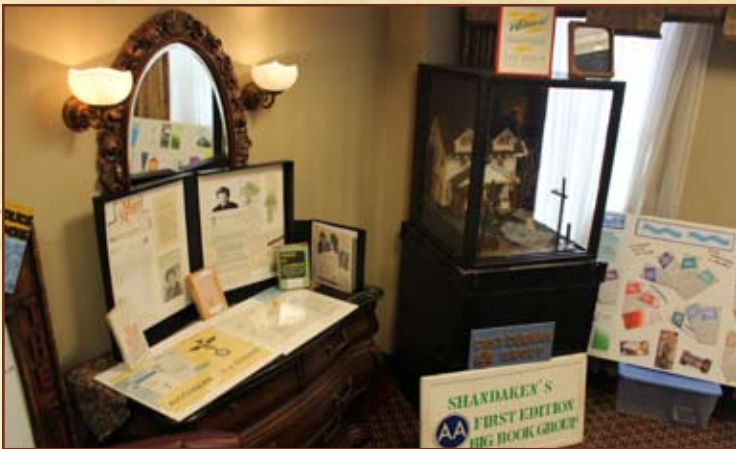
Marty Mann exhibit on the Left. Handmade signs for AA meetings. Diorama of Dr. Bob’s home in Akron, Ohio.