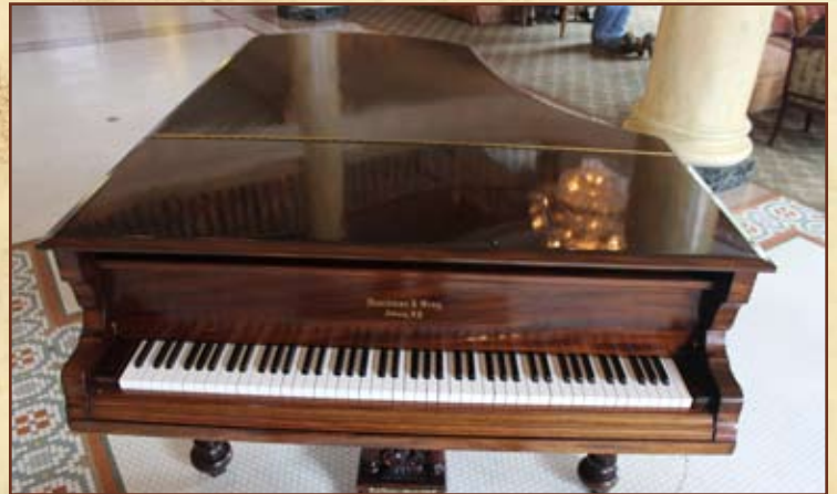
A Beautiful and Ornate Piano built by "Boardman & Gray Albany, NY". I had a wonderful time playing such an exquisite and fine-crafted instrument. The sound of music filled the air and resonated throughout the Lobby and the Mezzanine.