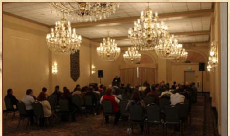
The Crystal Ballroom.