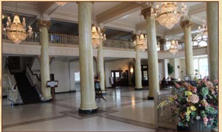
The Main Lobby of Hotel Utica. The Registration table was setup next to the Stairway. There was Hospitality Volunteers serving beverages and snacks upstairs along the Mezzanine floor. Grapevine and AA Literature were also available here.