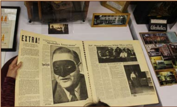
“EXTRA!, EXTRA! read all about it” Articles from the Madison, Wisconsin newspaper “The Journal-Herald” dated May 17, 1942, with the title “Alcoholics Anonymous, national organization without officers or dues.”