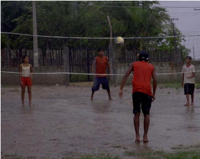
...but the games continued on.... then out came the sun!

With a beach offering plenty of swimming, a water-balloon toss, a torrential 12-noon downpour, and a subsequent volley-ball game in ankle-deep rain runoff, not a single one of the 100+ attendees at Sunday's District 4 Picnic were heard complaining about our the present drought. The "togetherness" under the pavilion was AWSOME as people huddled together during the height of the wind and rain. Then, as predictable, out came the sun!